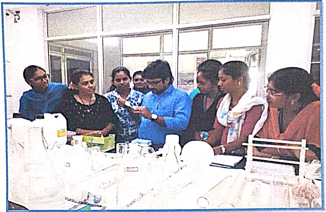
ISOLATION OF ORGANIC PESTICIDES ON NEEM LEAVES